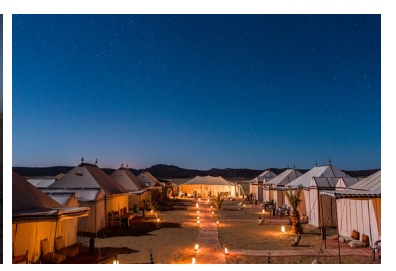
OVERNIGHT IN SAHARA DESERT CAMP WITH THW NOMADS FAMILY OF IDRE *****